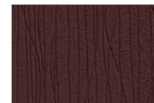
Red Pear SF-100