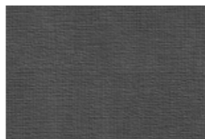
Med. Grey BYS-115