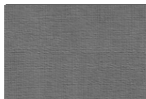
Sky Grey BYS-119