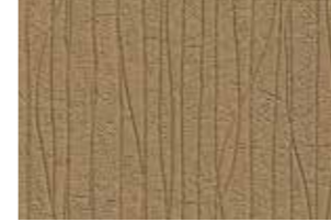
Lt. Sand SF-104