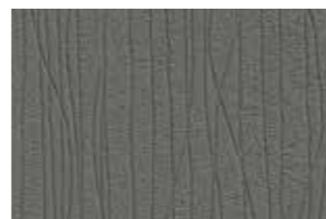
Med. Grey SF-106