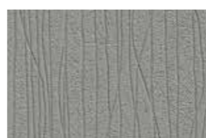
Warm Grey SF-118