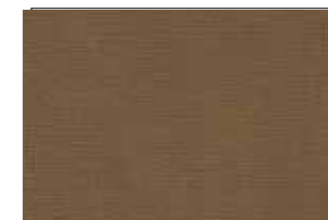
Empire Tan BYS-112