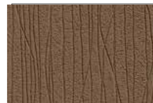
Empire Tan SF-109