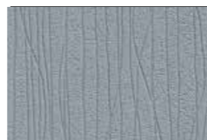
Sky Grey SF-110