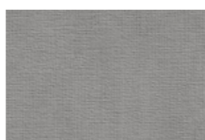
Warm Grey BYS-102