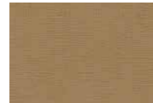
Lt. Sand BYS-122