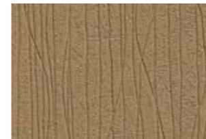
Lt. Sand SF-104