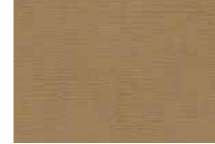
Lt. Sand BYS-122